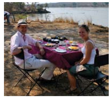
Left Idyllic beaches in Zanzibar. Above An unusual, but magical, place to have breakfast: on the shores of a hippo-filled river in Tanzania